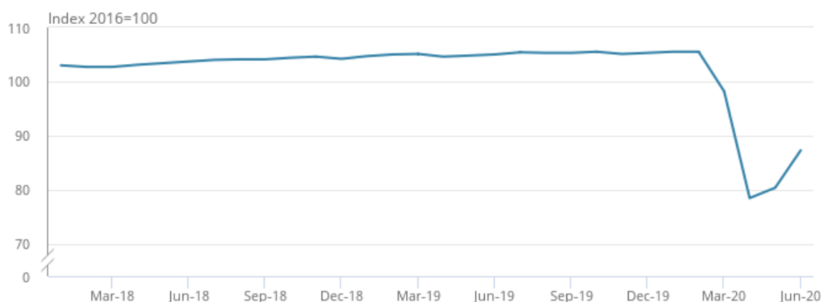
Figure 2: Monthly Gross Domestic Product (GDP), seasonally adjusted, UK, Jan 2018 – June 2020